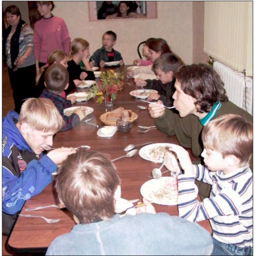
After school Rodnichock becomes a busy place. Street children gather to eat and do homework. They fellowship and learn skills. On weekends the center offers church activities for the families.