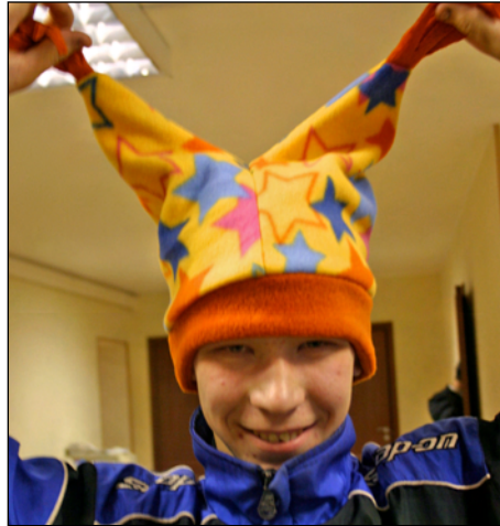
They loved their new hats! Sewing bedding @ right.