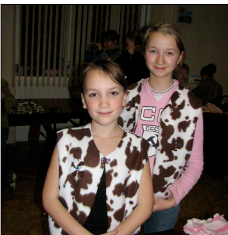
The children are priceless and have enjoyed sewing and playing with CASMI teams.