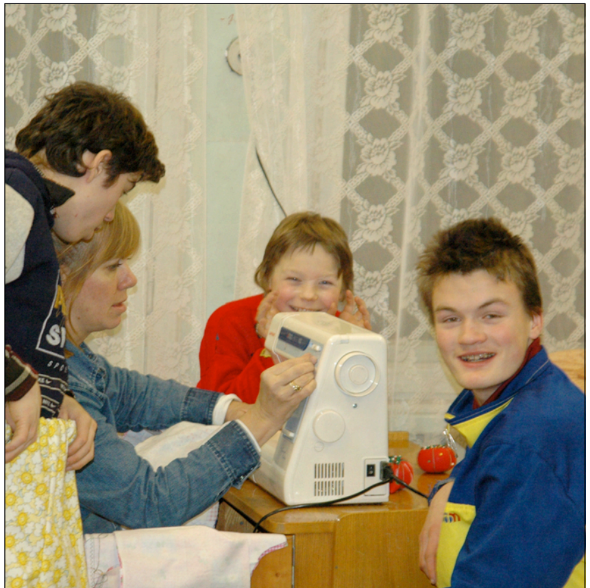
Even the boys love to sew in this home. Handicapped children are a big part of the sewing program as well. They are sewing with a CASMI volunteer and very excited to be making new pajama pants!